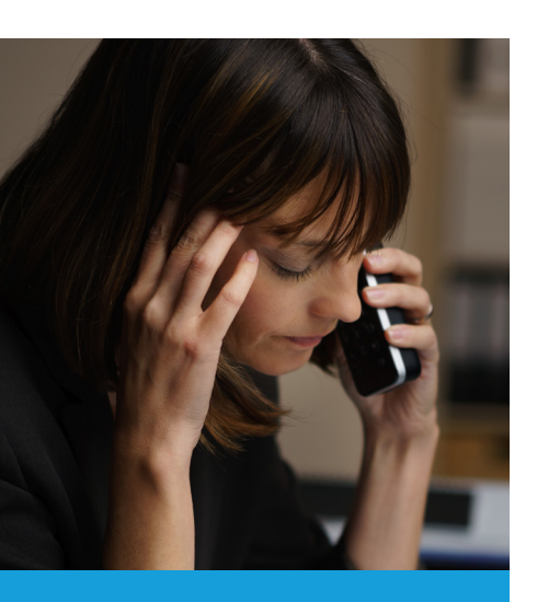
You don't have to tell us who you are or give us identifying information. We're here to help.

If you're struggling with sexual thoughts and behaviours towards children, touching children inappropriately or looking at indecent images of under 18s online, we can help you manage your thoughts and change your behaviour.